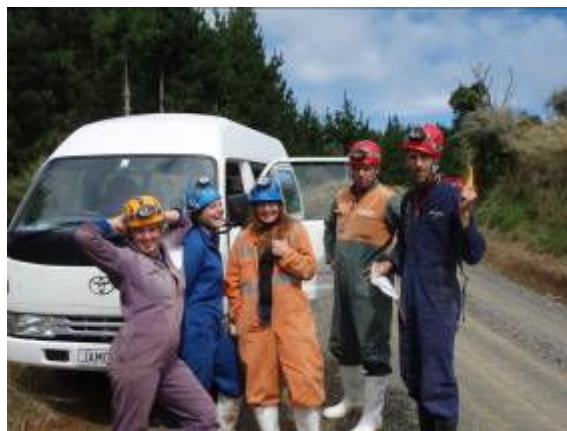
Staff training—Caving at Mahoenui, Totoro Road caves

This term the focus of learning has been on kayaking and rafting skills as well as the core operations of TOPEC as an Outdoor Centre.