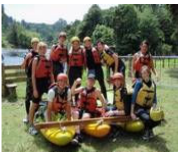
Coastal Senior Leadership 2009